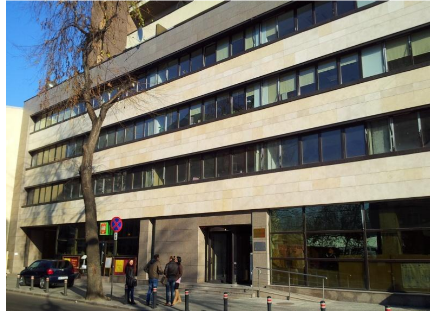
163 Mihai Eminescu Street, Bucharest

BIRDA provides specific services to the local public administration as well as to the private sector for the development of the Bucharest-Ilfov region