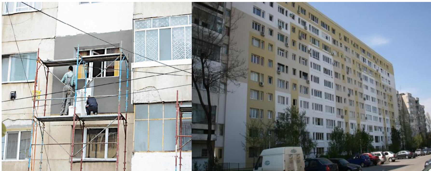
District 3, Bucharest