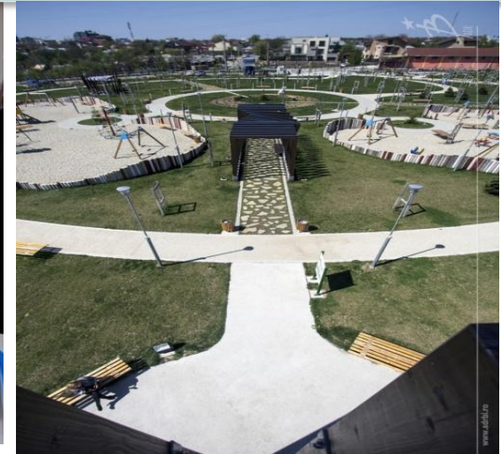
“Pipera” Park in Voluntari City