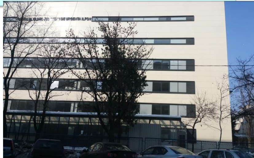
Ilfov County Hospital