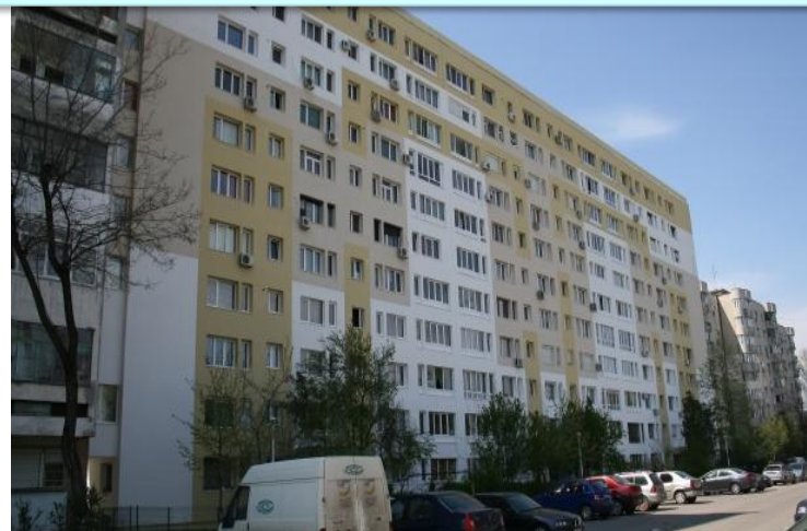
District 3, Bucharest