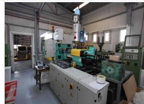
Vitra Instruments, Otopeni, Ilfov County