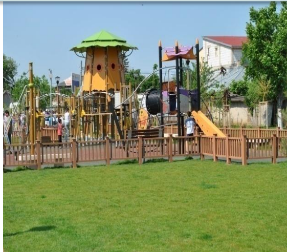
“Ion Creanga” Park in District 2