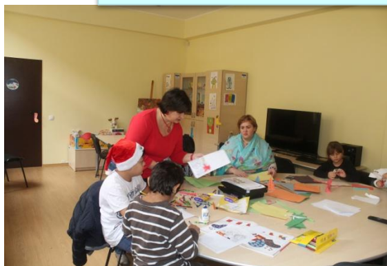
The "Sf. Nicoale" Social Centre of District 4