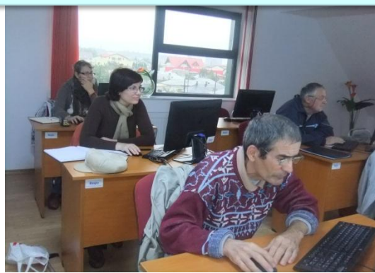
Social centre located in the "Ion Creanga" neighborhood of District 2