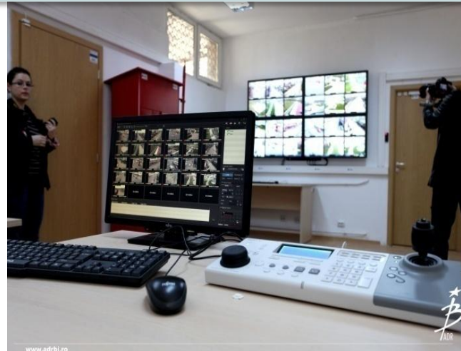
Video surveillance equipment in Bragadiru