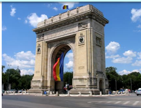
Arch of Triumph, Bucharest