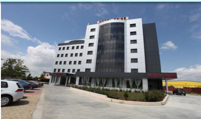
Criss Hotel, Bucharest