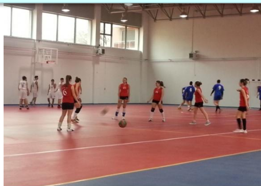
"C.A. Rosetti" High School of Bucharest