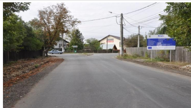
National Road 1 Buftea