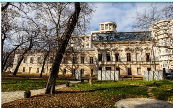
"Casa Cesianu", Bucharest