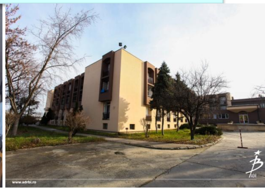
Social centre of the Federation of Jewish communities in Romania