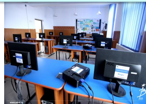
Lower secondary school, Dascalu Commune, Ilfov County