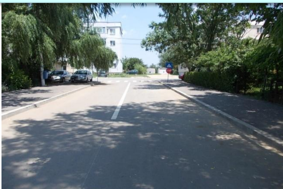
Modernized urban street in Magurele City, Ilfov County