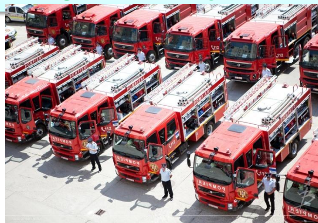
The Bucharest-Ilfov “Dealul Spirii” Inspectorate for Emergencies