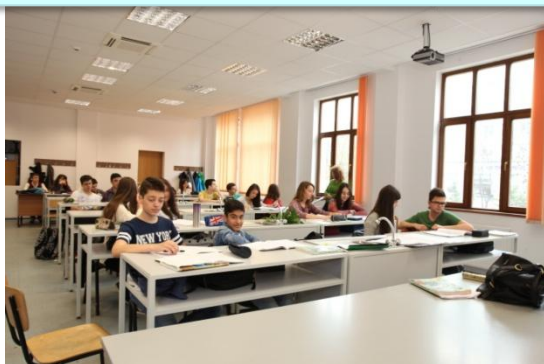
"I. Hasdeu" College of Bucharest