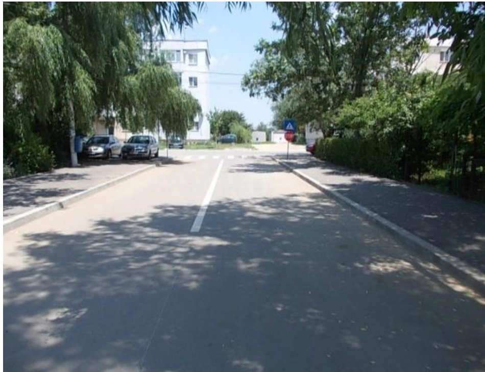
Modernized urban street in Magurele City, Ilfov County