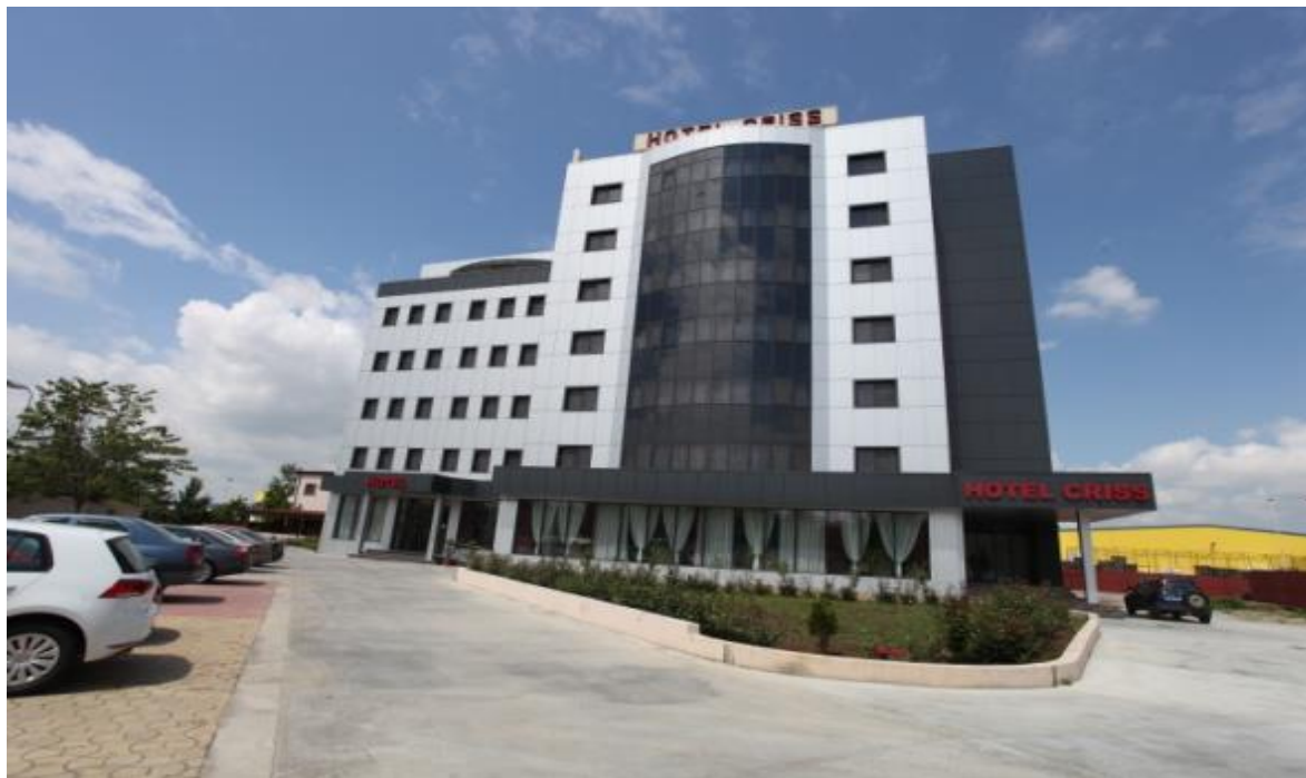
Criss Hotel, Bucharest