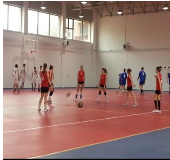
“C.A. Rosetti” High School of Bucharest