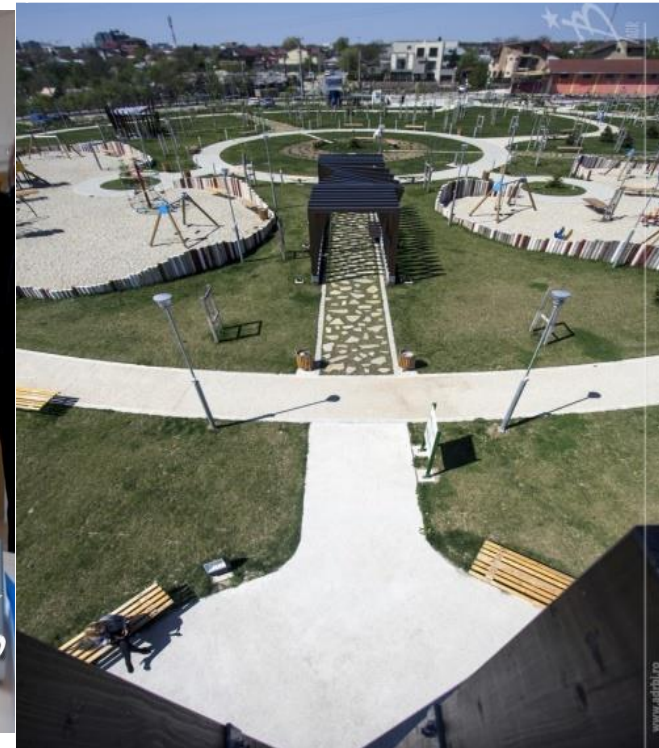
“Ion Creanga” Park in District 2