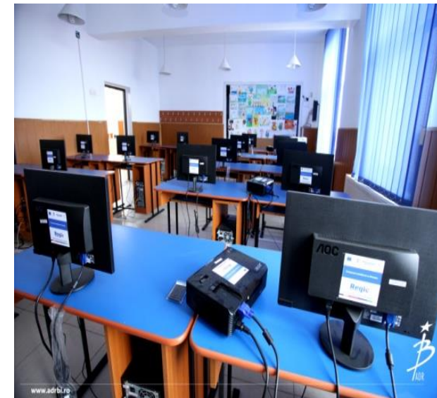
Lower secondary school, Dascalu Commune, Ilfov County