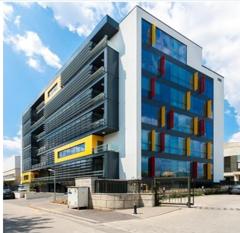
Siriului Residence business center