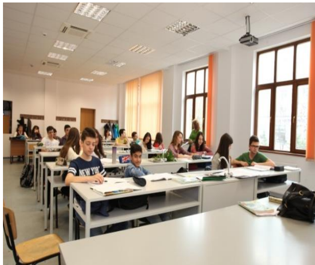
“I. Hasdeu” College of Bucharest