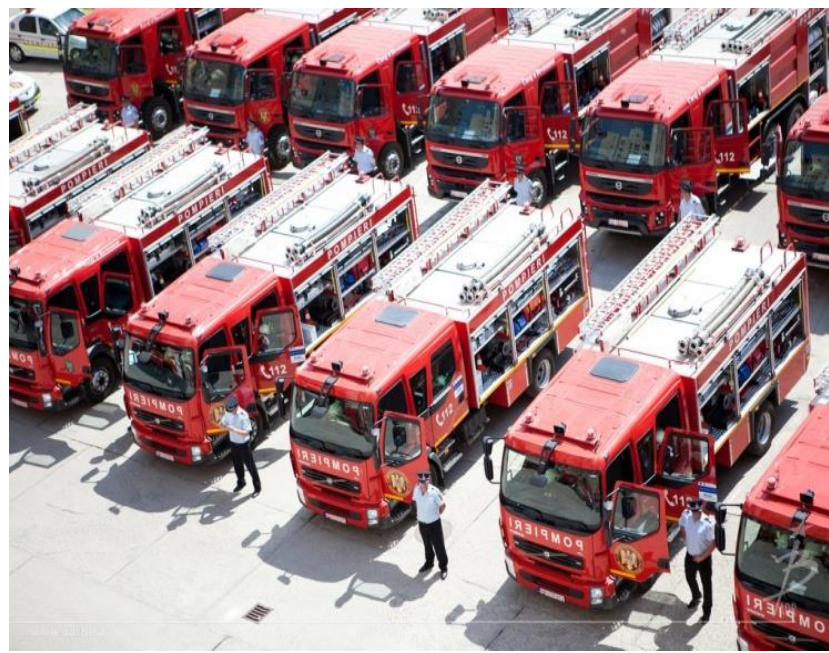
The Bucharest-Ilfov “Dealul Spirii” Inspectorate for Emergencies