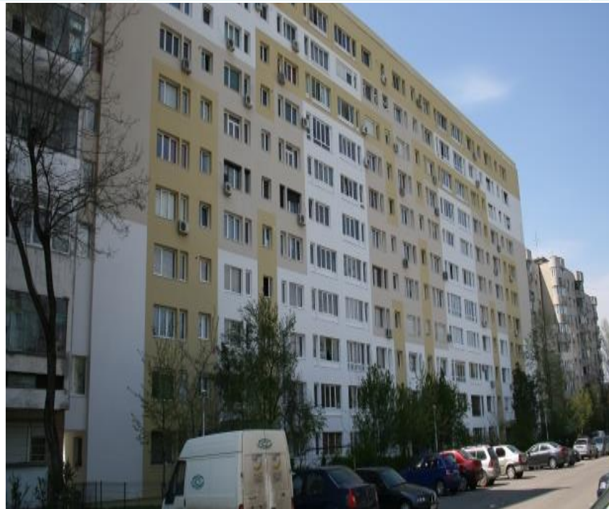
District 3, Bucharest