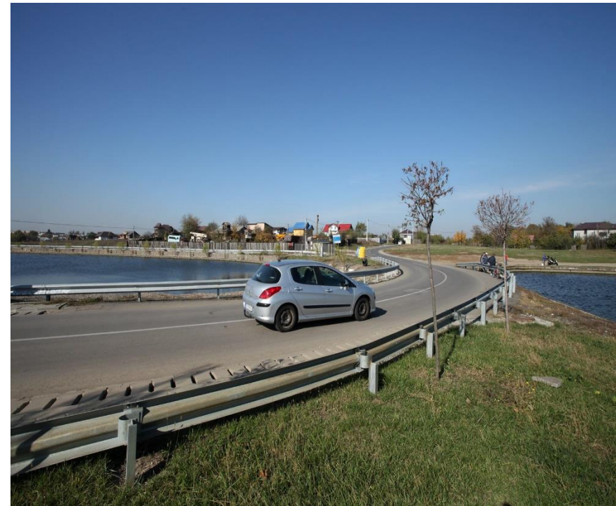
Modernized urban street in Chitila City, Ilfov County