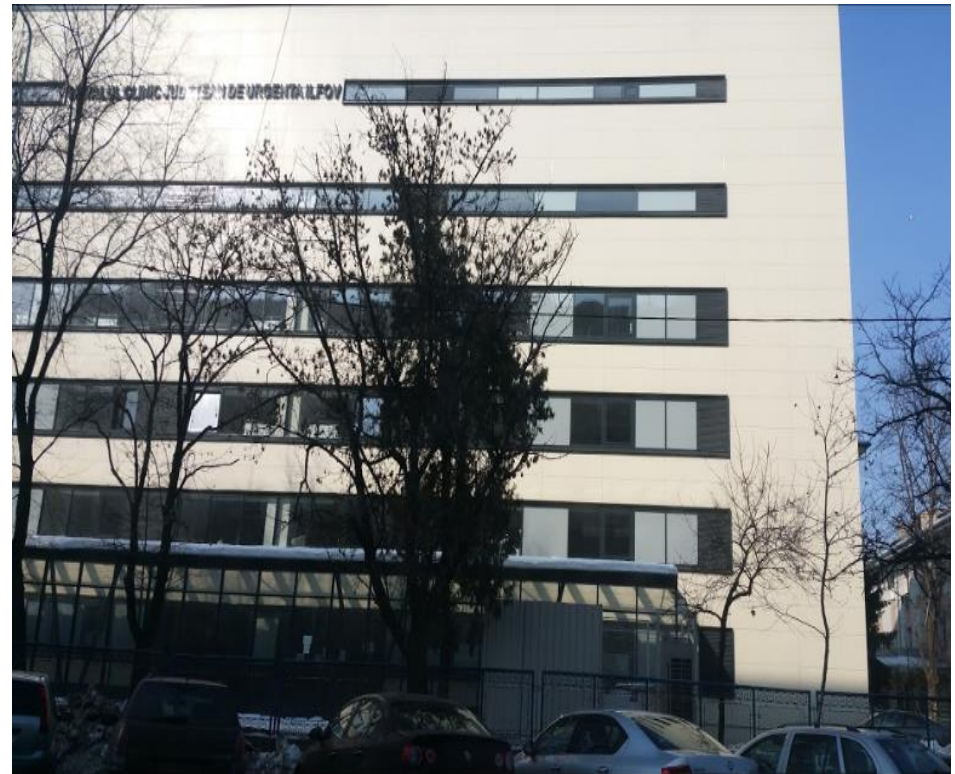
Ilfov County Hospital