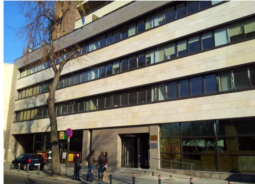
163 Mihai Eminescu Street, Bucharest

BIRDA provides specific services to the local public administration as well as to the private sector for the development of the Bucharest-Ilfov Region