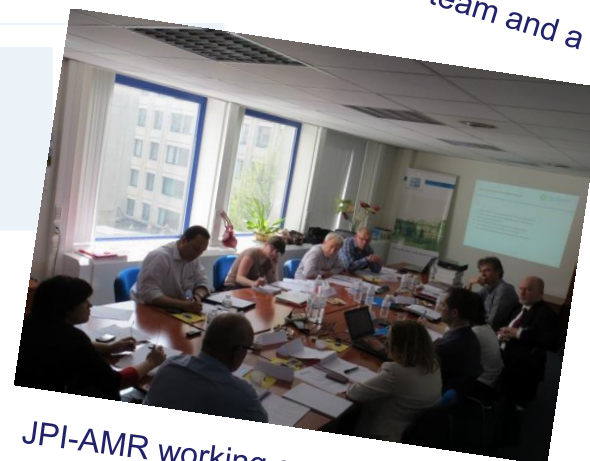
JPI-AMR working group at ROST