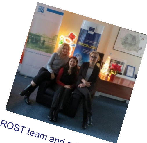
ROST team and a trainee