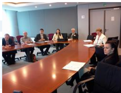
ROST at the European Parliament