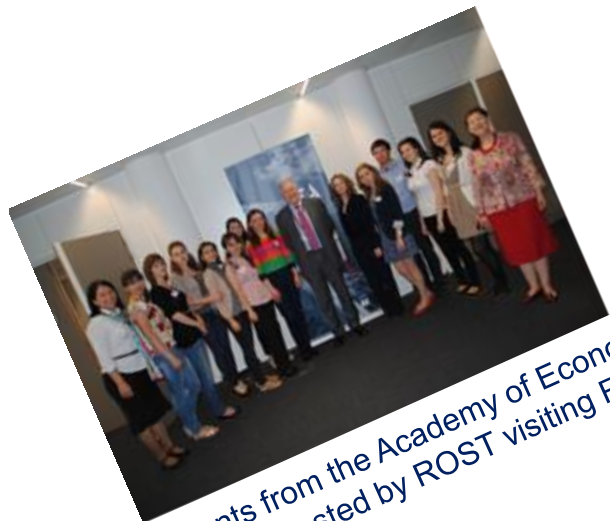
Students from the Academy of Economic Sciences hosted by ROST visiting REA