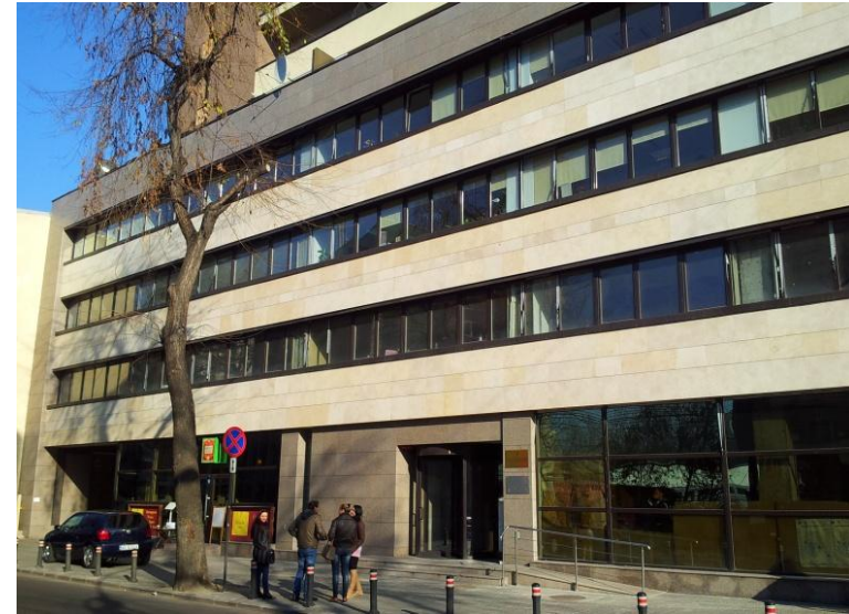
163 Mihai Eminescu Street, Bucharest

ADRBI provides specific services to the local public administration as well as to the private sector for the development of the Bucharest-Ilfov Region